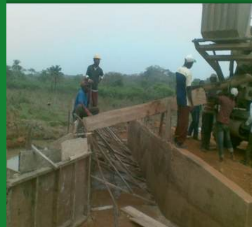
CASTING OF SINGLE BOX REINFORCED CONCRETE CULVERT.