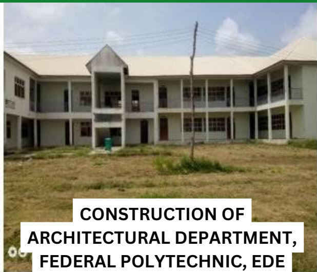
CONSTRUCTION OF ARCHITECTURAL DEPARTMENT, FEDERAL POLYTECHNIC, EDE