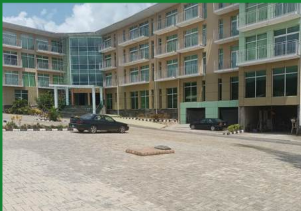
Construction of Ayonete Hotel & Resprts Building, Okene.