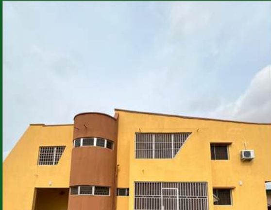
Institute of Legislative Studies, Unillorin