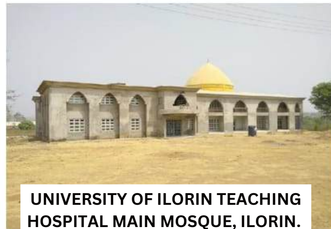
UNIVERSITY OF ILORIN TEACHING HOSPITAL MAIN MOSQUE, ILORIN.