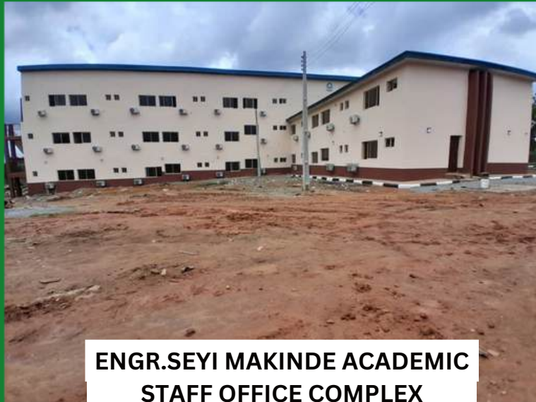
ENGR. SEYI MAKINDE ACADEMIC STAFF OFFICE COMPLEX