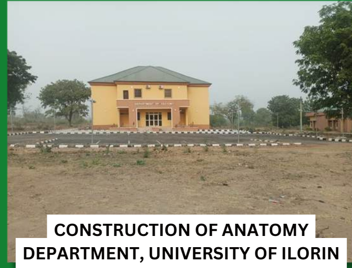
CONSTRUCTION OF ANATOMY DEPARTMENT, UNIVERSITY OF ILORIN