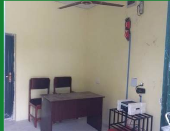
Supply of Office Equipment, UBEC