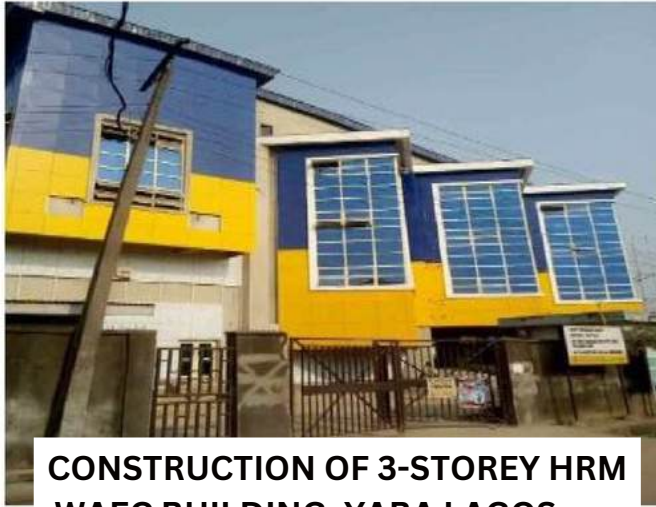
CONSTRUCTION OF 3-STOREY HRM WAEC BUILDING, YABA LAGOS