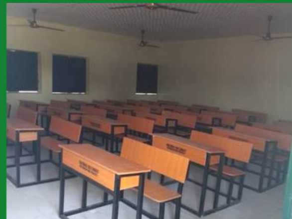
Supply of classrooms Furniture, UBEC