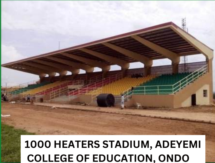
1000 HEATERS STADIUM, ADEYEMI COLLEGE OF EDUCATION, ONDO