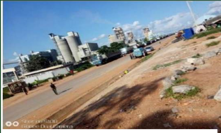
CONSTRUCTION OF OBAJANNA-KABBA ROAD.