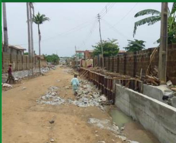
CONSTRUCTION OF FLOOD CONTROL DRAINAGE SYSTEM.