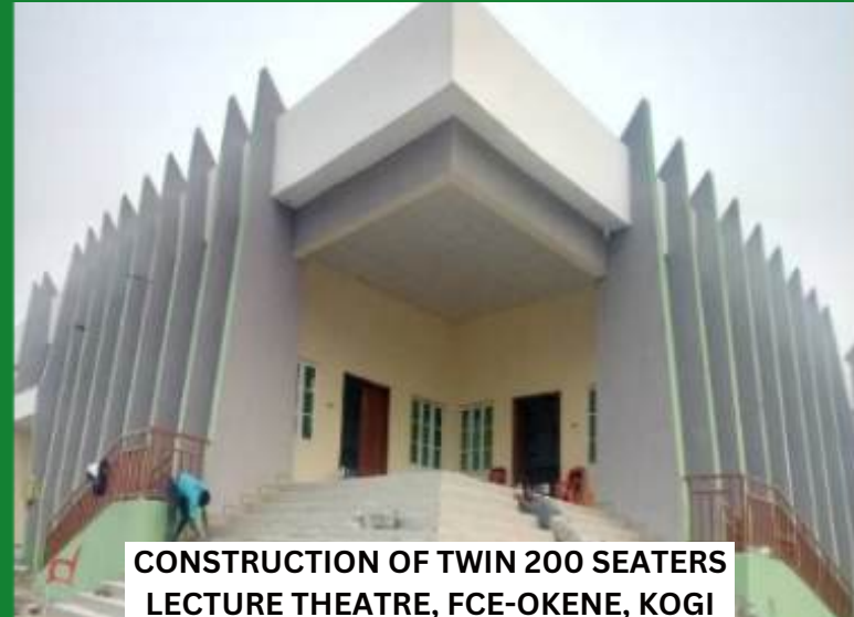
CONSTRUCTION OF TWIN 200 SEATERS LECTURE THEATRE, FCE-OKENE, KOGI STATE.