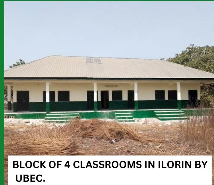
BLOCK OF 4 CLASSROOMS IN ILORIN BY UBEC.