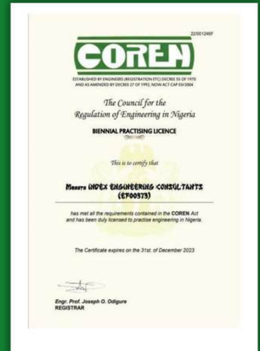
COMPANY'S COREN REGISTRATION CERTIFICATE