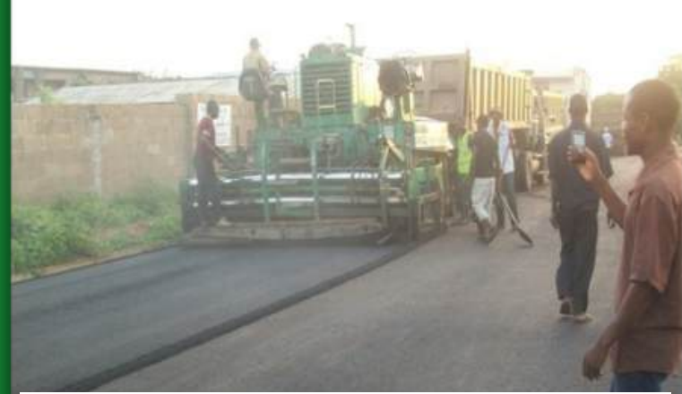
ASPHALT LAYING AT ODOKUN ROAD.